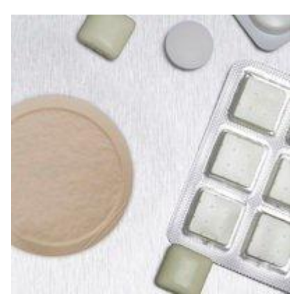
Coronavirus (COVID-19): effective options for quitting smoking during the pandemic

This Special Collection brings together Cochrane Reviews identified as most directly relevant to the prevention of infection. This collection is available in Simplified Chinese, Czech, English, German, Farsi, French, Japanese, Malay, Polish, Portuguese, Russian, and Spanish.