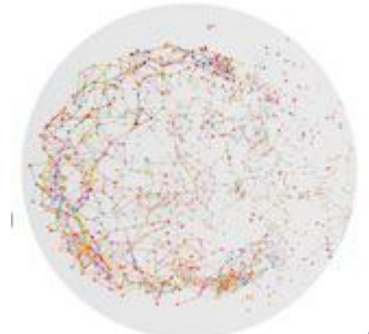
COVID-19: working together and making a difference for